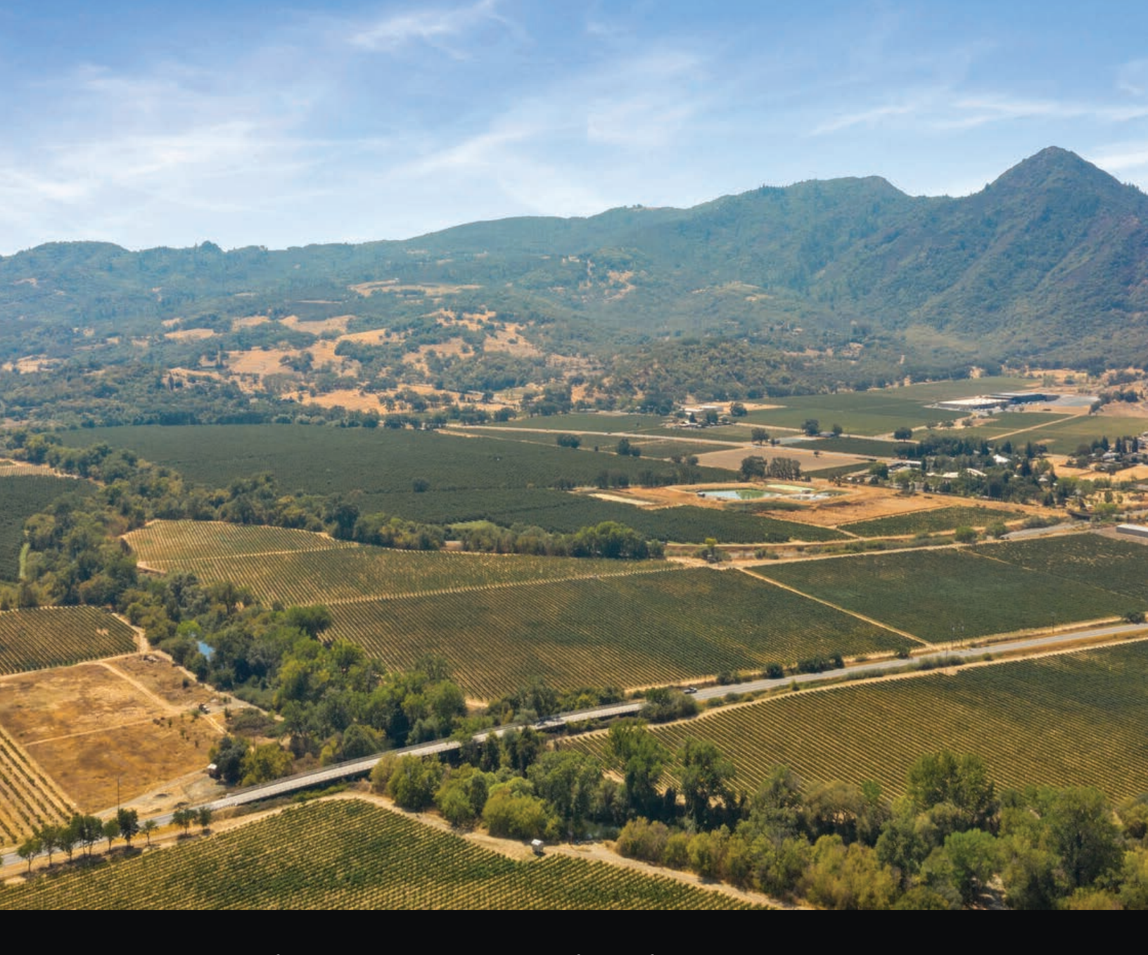
14000 S Highway 101, Hopland Offering Memorandum Price $4,000,000